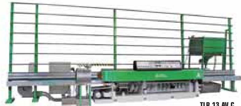
TLR 13 AV C