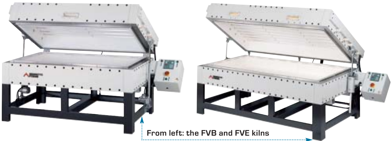
From left: the FVB and FVE kilns