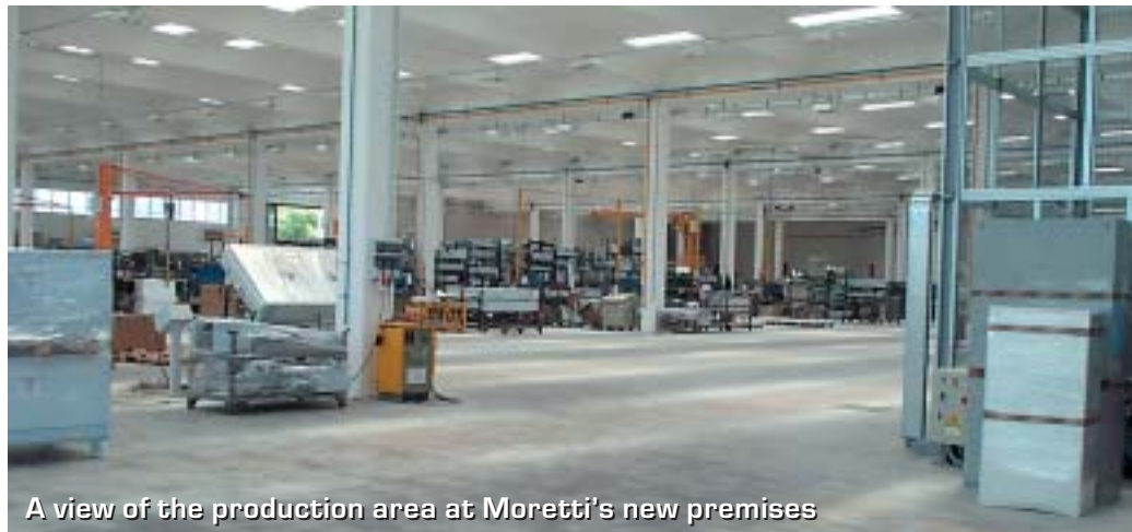
A view of the production area at Moretti's new premises

T he entry in the glass and ceramic sectors was quite a logical step for Moretti Forni, expert in the manufacture of industrial ovens for professional bakery since 1946.