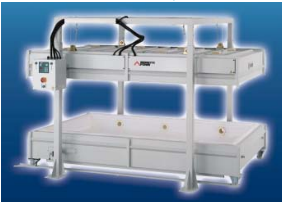
One of Moretti Forni's largest kilns - the FVM

When inserted in an ordinary kiln, the ATL can be used to produce perfectly shaped and finished washbasins from a flat sheet of glass, forming the bowl by gravity. ATL is an extremely versatile modular project, allowing one or more components to be inserted in each model in the line of kilns, and can be stored with ease when not in use. Each ATL is equipped with high precision electronic control indicating the various shaping phases. Moreover, the various diaphragms available allow the creation of round or oval basins.