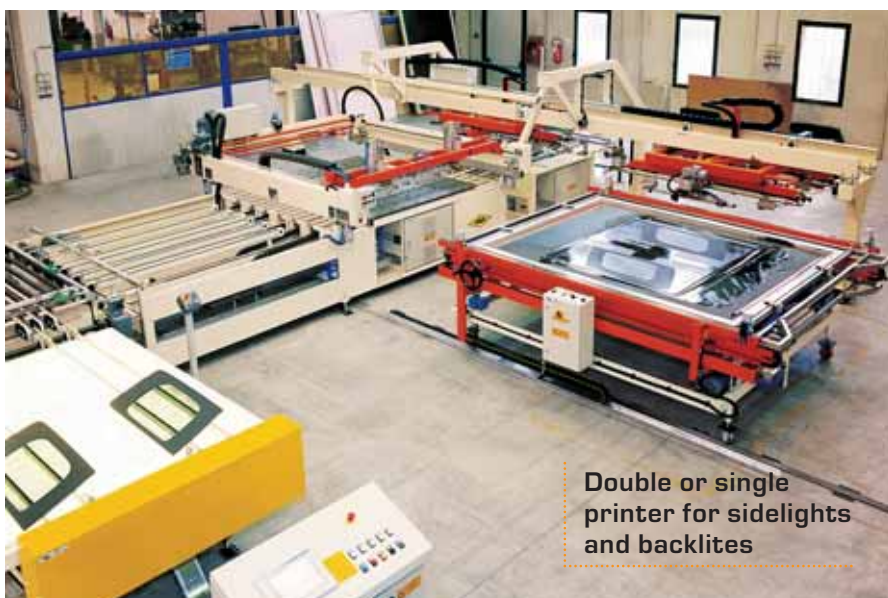
Double or single printer for sidelights and backlites