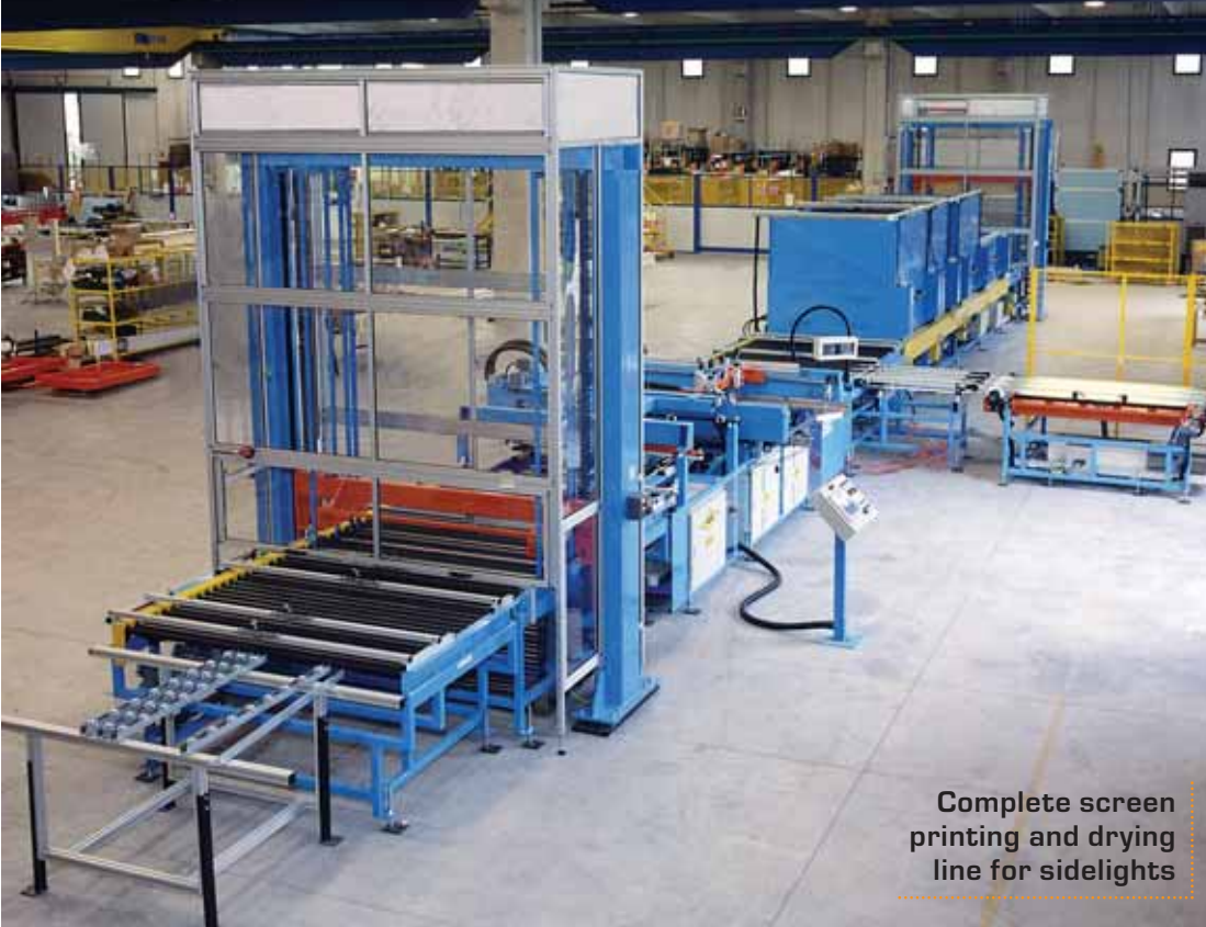
Complete screen printing and drying line for sidelights

nel and who can follow the detailed and simple instructions contained in the service manual. Should more information be required, AISA guarantees prompt after-sales assistance. Its qualified personnel is always available to solve any kind of servicing issue from the office (e-mail exchange, telephone calls, videoconference) or also by sending its skilled workers on the spot in any area of the world rapidly. This is one of the reasons why AISA's