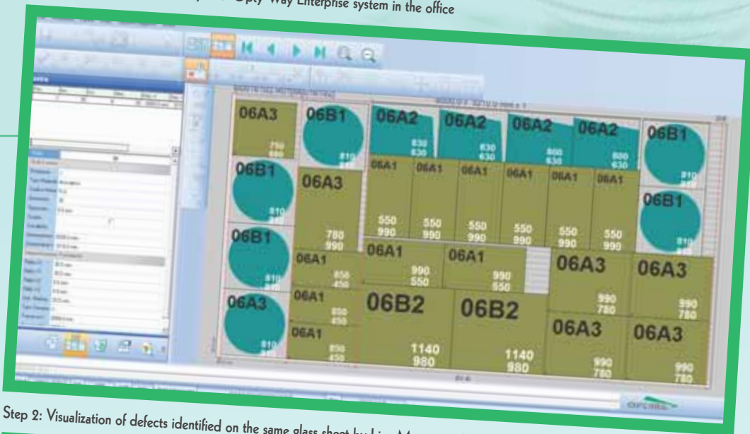
Step 2: Visualization of defects identified on the same glass sheet by Line Manager onboard the machine