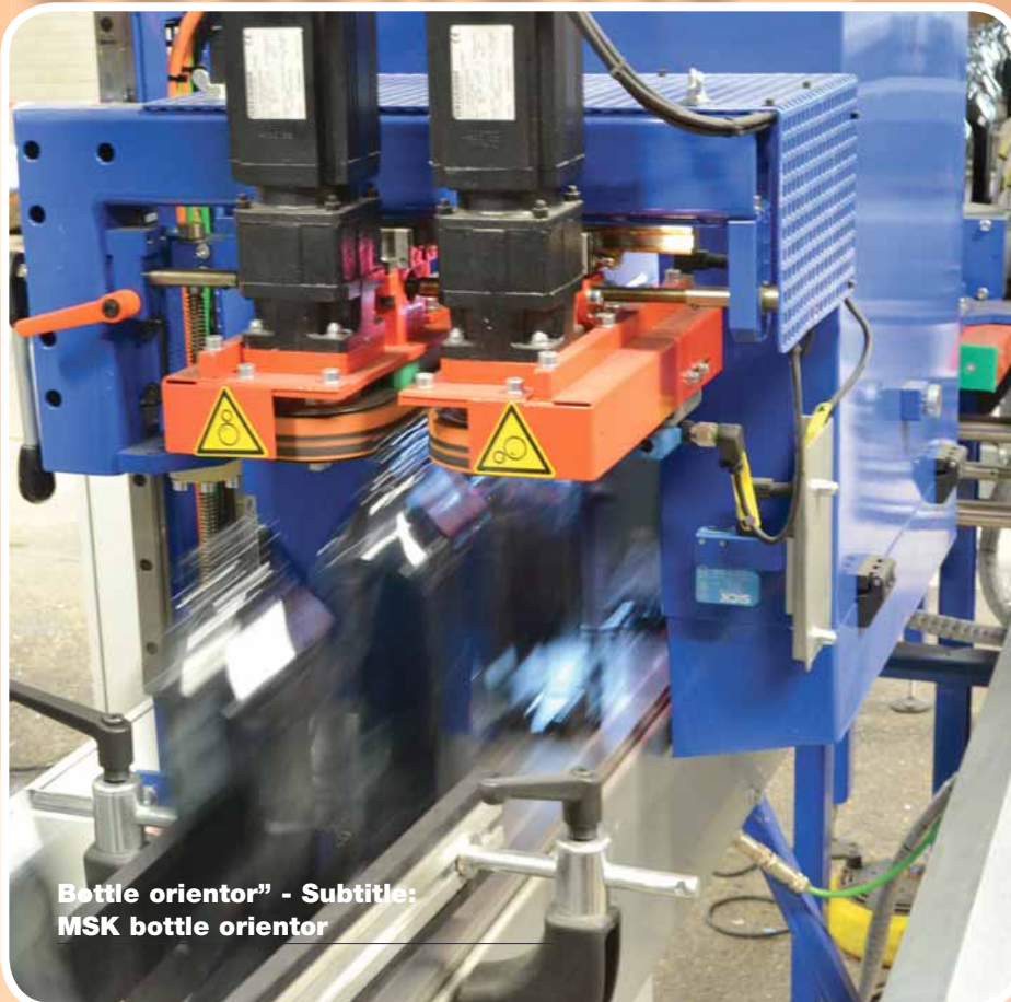
Bottle orientor" - Subtitle: MSK bottle orientor

At this year's glasstec, MSK will be focussing on its philosophy "savings through technology". On show will be shrink packing solutions and the new MSK bottle orientor system, as well as an innovation to save up to 40 per cent in energy.